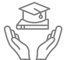
Education & Government